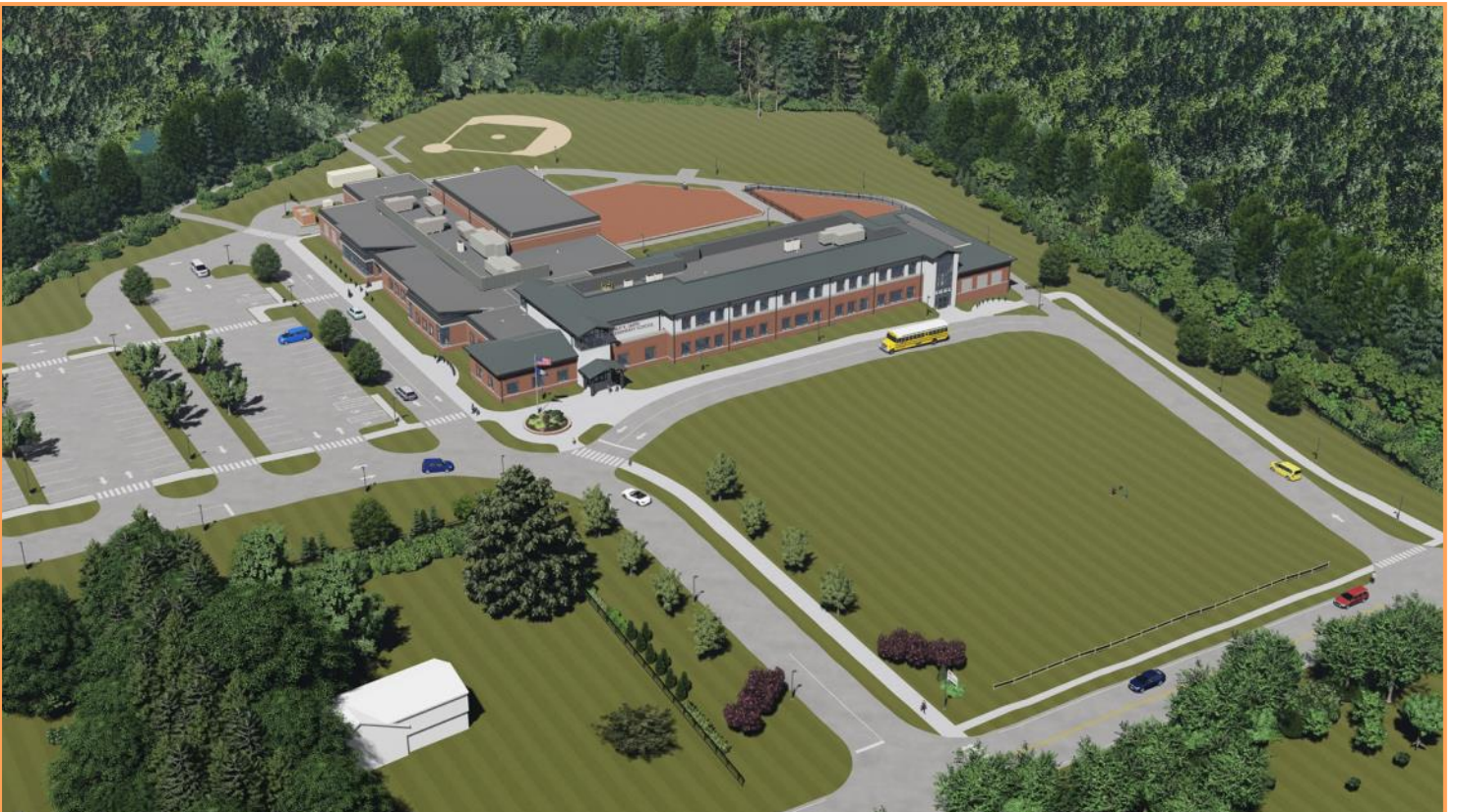
Philip R. Smith Elementary School