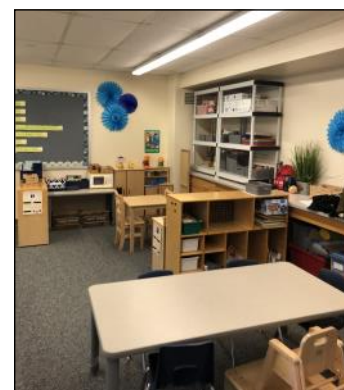
One of the new classroom spaces