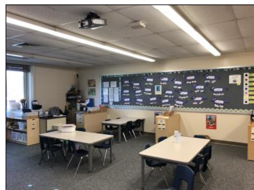
One of the new classroom spaces