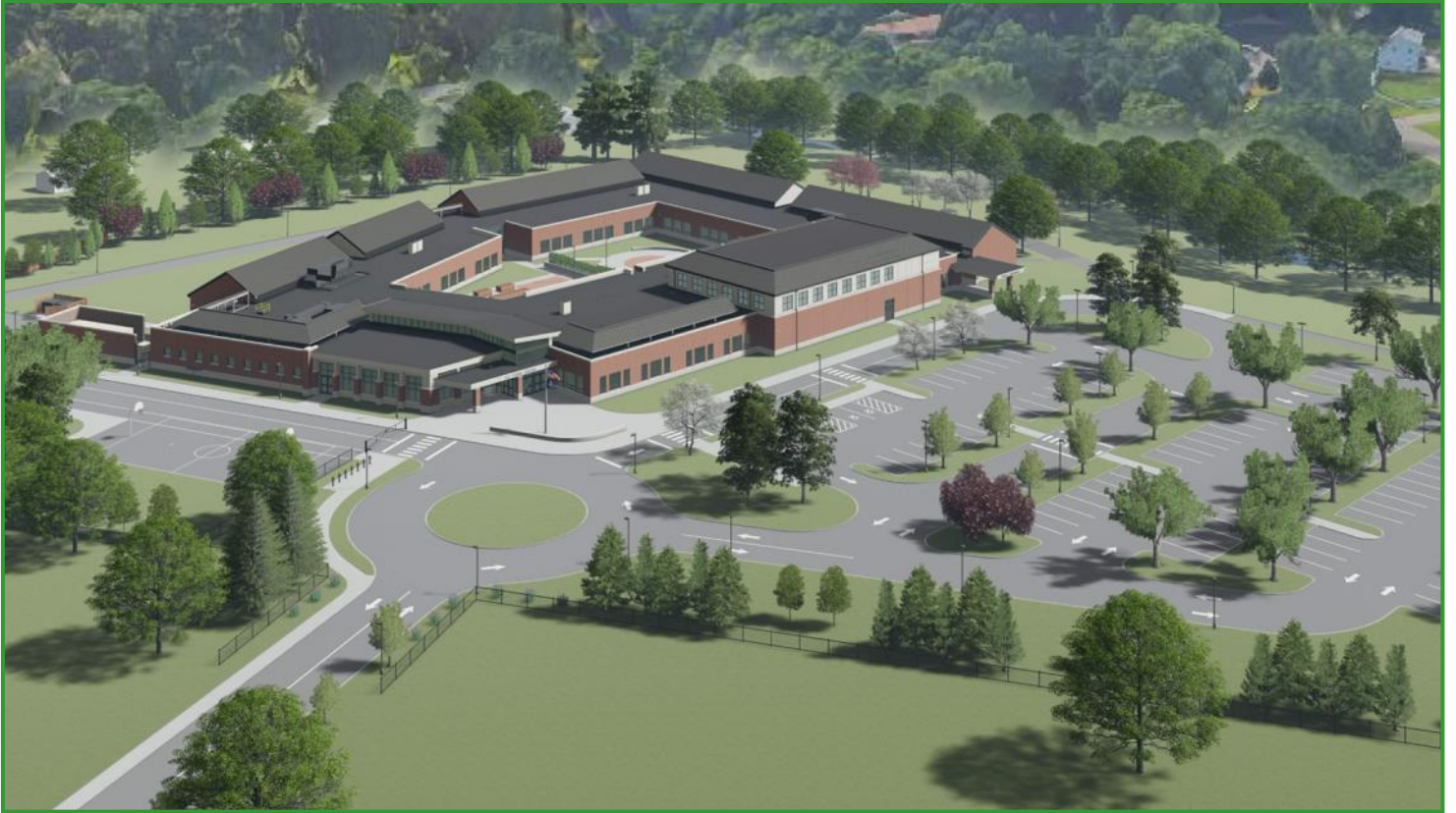
Eli Terry Elementary School