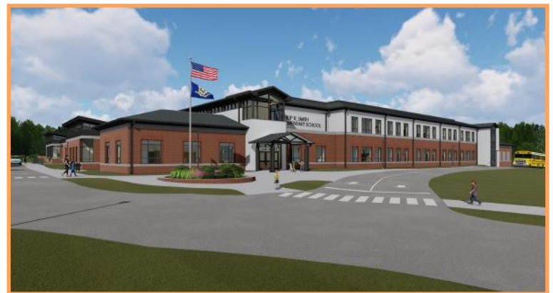
Exterior Rendering of New Philip R. Smith School