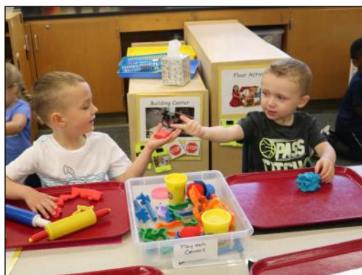
Students working together