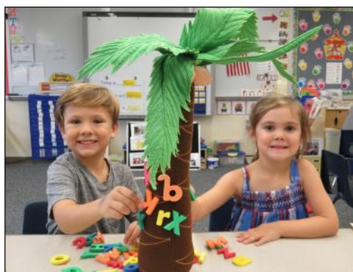
Students at play in learning center