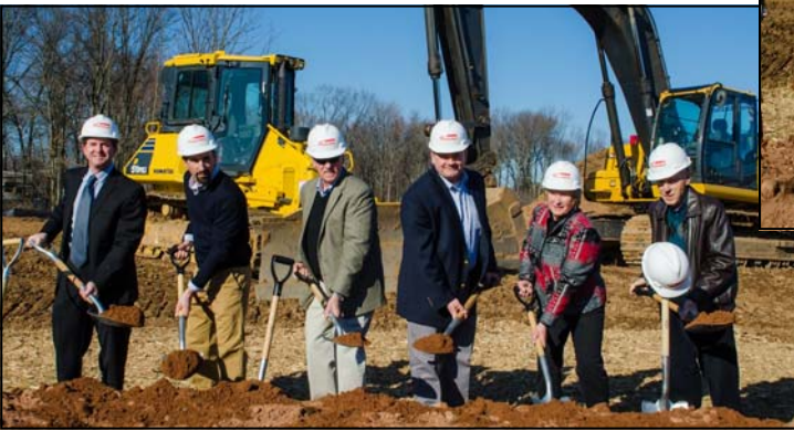
Public Building Commission