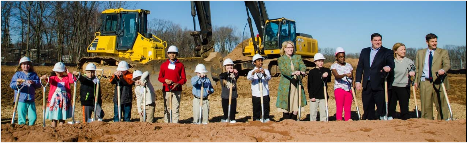
Elementary students and principals