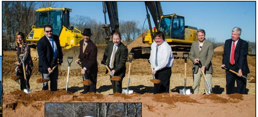
Board of Education