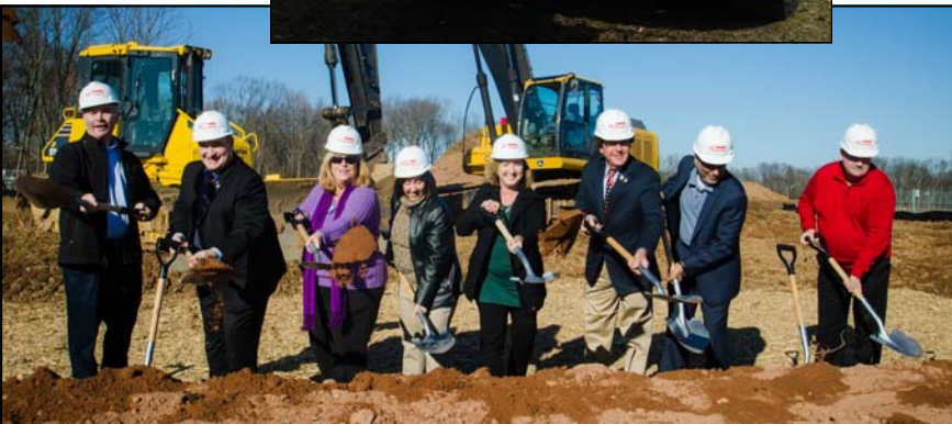
Town Council and Town Manager